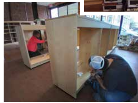
Right: Custom bookcases getting assembled