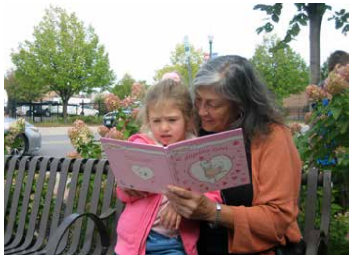
Enjoying a new storybook