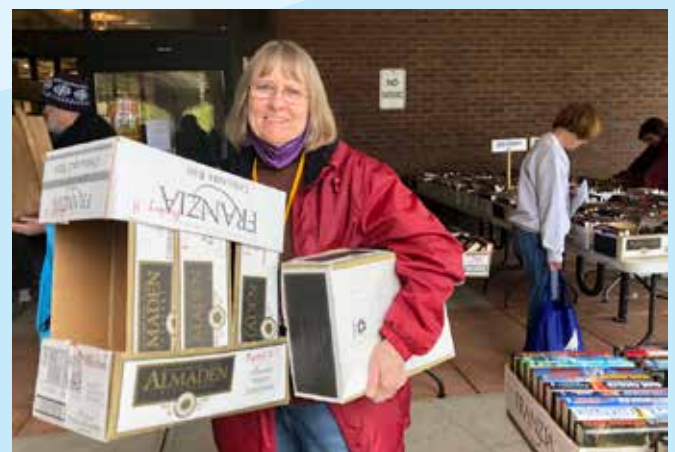
Empty boxes = books sold = more to restock!