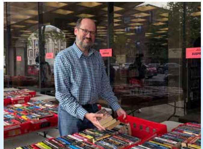
Small (size) books are a big job