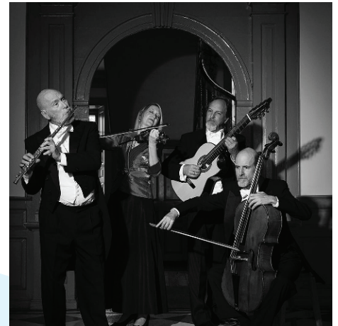
Musicians of Ma'alwyck