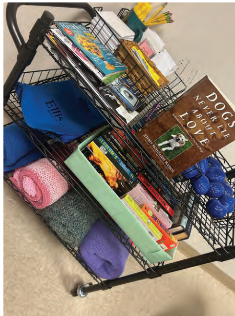
Patient "comfort cart" at Ellis Medicine

Ellis Medicine recently on their patient "comfort cart." Ellis' volunteer service was very appreciative of the Friends' donation of books to lend to patients during their stay on the nursing floors.